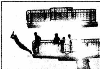
Exercise, go for a swim.

Preference is given to short, typed letters. We reserve the right to edit letters. Letters must carry full name, address and phone number.