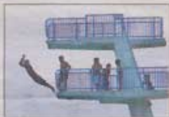
Exercise, go for a swim.

Preference is given to short, typed letters. We reserve the right to edit letters. Letters must carry full name, address and phone number.