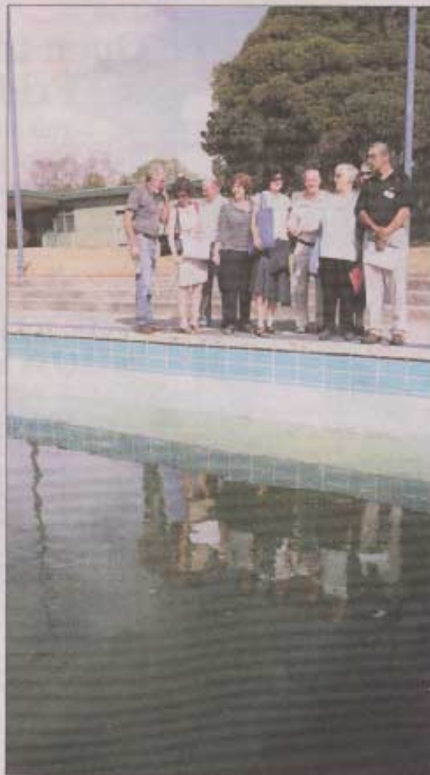
Brighter future?: Oakleigh community groups inspect the pool site last Thursday.

The formal public consultation process continues with speak-outs next month, with a final report delivered to the council by May.