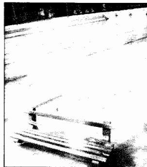
Have a seat?: The pool has been left to deteriorate.

the inclusion of a shallow-water pool for seniors and children.