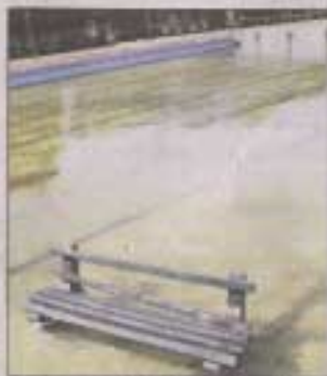
Have a seat?: The pool has been left to deteriorate.

the inclusion of a shallow-water pool for seniors and children.