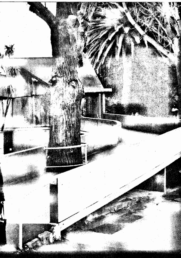
brutalism, best described as "a celebration of concrete".