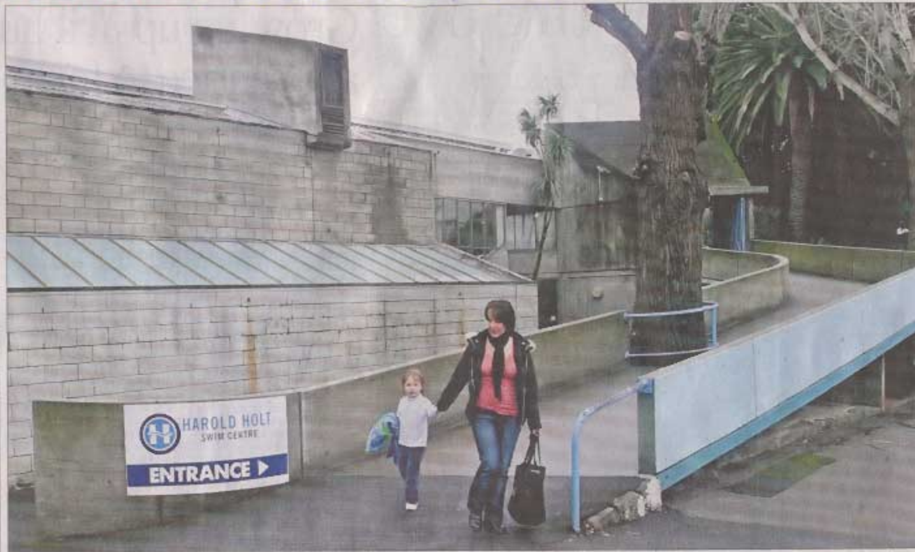
It ain't pretty but it's art: Malvern's Harold Holt Swim Centre has won heritage protection as an example of architectural brutalism, best described as "a celebration of concrete".