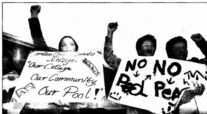
Protesters braved rain yesterday to fight for Sunshine's pool.

Following a community and union picket on Tuesday to stop demolition of the old outdoor pool, the council voted to renege on the contract for an adjacent new indoor pool centre, prompting State Sports