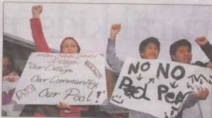
Protesters braved rain yesterday to fight for Sunshine's pool.

Following a community and union picket on Tuesday to stop demolition of the old outdoor pool, the council voted to renege on the contract for an adjacent new indoor pool centre, prompting State Sports